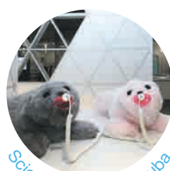
Science Square Tsukuba