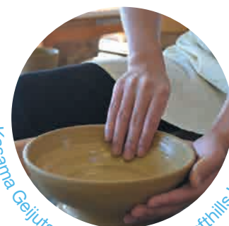
Kasama Geijutsu-no-mori Park (Craft Hills Kasama)