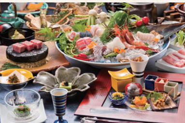
A sample dinner course at a Japanese inn