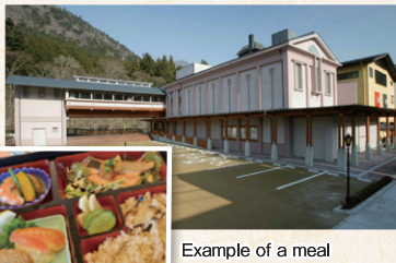
Example of a meal