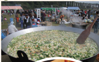
Iroriyaki (charcoal grill)