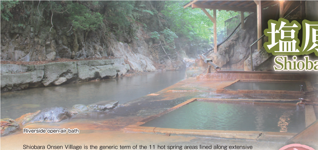
Riverside open-air bath