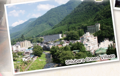
Shiobara Onsen Village

Shiobara Onsen Village is the generic term of the 11 hot spring areas lined along extensive Nasunogahara in the north of Tochigi prefecture to the valley of the Houkigawa River which goes into the mountain range that extends toward northwest. The hot springs is said to have been found in 806, and have healed visitors' body and soul for more than 1200 years. After Shiobara-kaido (Route 400) was open to traffic in 1884, literary figures such as Soseki Natsume, Jun'ichiro Tanizaki and Mokichi Saito visited the village and Konjikiyasha was written by Koyo Ozaki here. Thus, they introduced the beauty of Shiobara Onsen. The village has more than 150 hot springs and is called a hot spring area with the largest amount of water in the northern Kanto. Guides for a walk in the towns and natural surroundings are available. (The word, Onsen Village was used for the 11 hot springs in Shiobara by a novelist, Katai Tayama in "Onsen meguri" (Visiting hot springs) for the first time in Japan in 1918.)