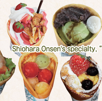
Shiobara Onsen's specialty, "Toteyaki"

Numappara Marshland is a subalpine marshland at 1,230m above sea level, 250m from east to west, 500m from north to south, and is between Hinode Daira Mountain (1,786m) of Nasu mountain range, Mt. Shirasasayama (1,719m) at the south end and Nishibotchi Deck (1,410m) on the west side of Mt. Shirasasayama.