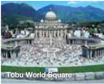
Tobu World Square

The Kinugawa onsen runs alongside the ravine of Kinugawa River, adjacent to a theme park area that includes Edo Wonderland (a reproduction of an Edo Period village) and Tobu World Square. Visitors can enjoy the beautiful ravine views while unwinding in the natural springs—just as the locals have done for centuries.