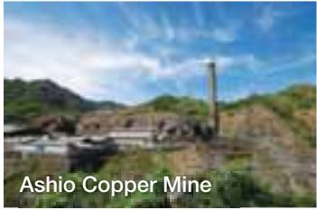
Ashio Copper Mine

The city of Ashio is set amidst ravines and mountains running southwest from Nikkō. Copper was discovered here in 1610, and the mine continued running until 1973. During the Edo Period, the copper was used for coins, and for the roof tiling of Nikkō Tōshōgū shrine and Edo castle. Technological improvements during the Meiji Era raised copper output considerably, establishing the town's reputation as the country's top copper provider.