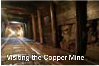
Visiting the Copper Mine