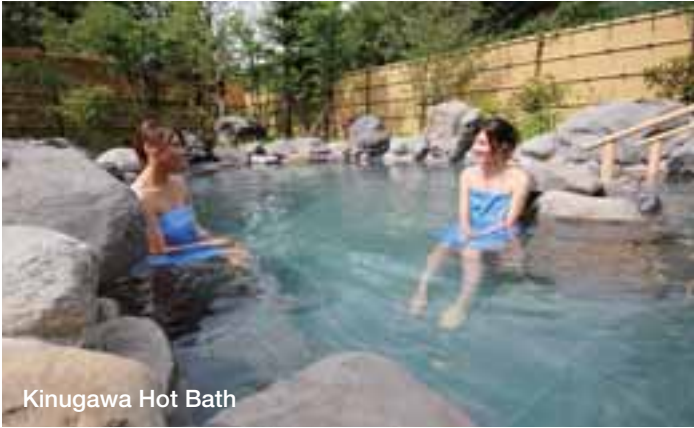
Kinugawa Hot Bath

Ryūōkyo Gorge runs about 3 km (1.6 miles) through hot mountain springs, the Kawaji onsen, and the Kinugawa onsen. This lovely gorge was carved out about 22 million years ago by the combined action of the Kinugawa river flow and the volcanic rock thrown out from undersea eruptions.